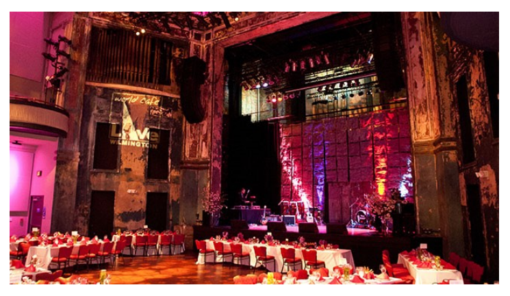
The Queen Theater

Unable to sponsor the full event? Consider a co-sponsorship with one of these event opportunities: