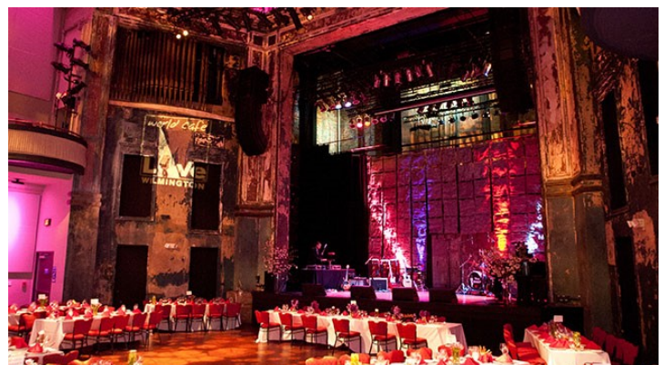
The Queen Theater

Unable to sponsor the full event? Consider a co-sponsorship with one of these event opportunities: