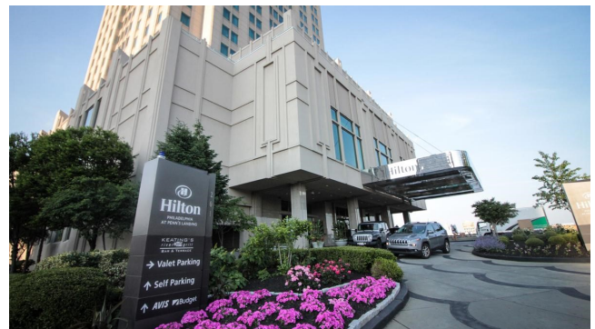
Hilton Penn's Landing